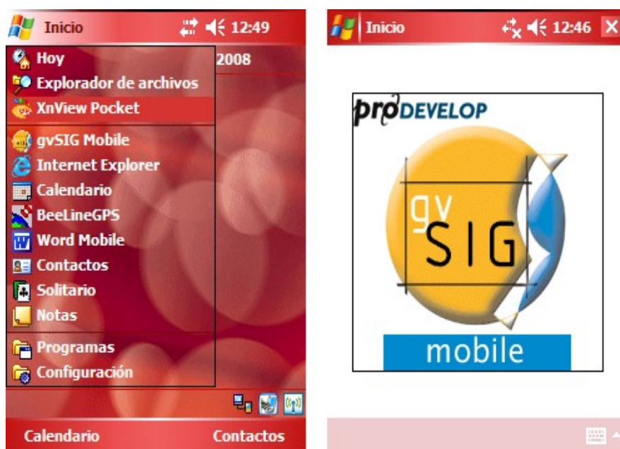
Inicio de gvSIG Mobile.

En el caso de que suceda algún problema en el proceso de ejecución de gvSIG Mobile, hay un archivo log que registra el proceso de lanzamiento y te muestra los posibles errores. Este archivo se encuentra en la carpeta de instalación y tiene el nombre de gvsig_mobile_launch.log . Por favor envíelo a la lista de usuarios de gvSIG.